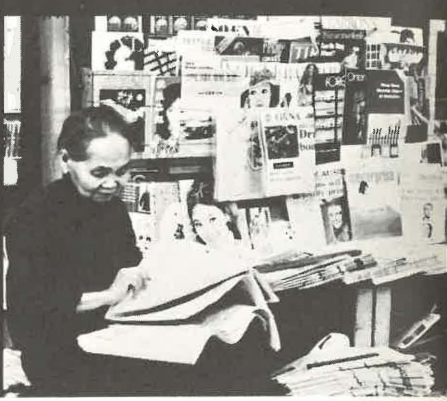
In every aspect of life in Hong Kong, the old, trusted traditions blend naturally with the new.